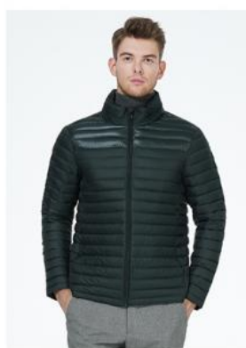
Dark Green (M801)