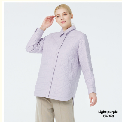
Light purple (G760)