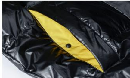
Pockets use hidden button closure Side pockets on the bottom use hidden button closure.