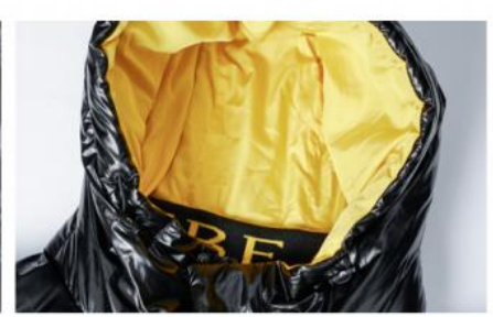
Stylish hood Lining of hood adopts contrastcolor.