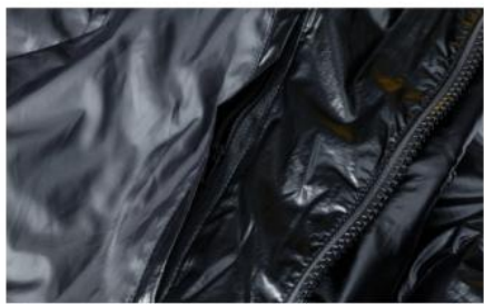
Inner pocket Inside zip pocket is safe to carry things.