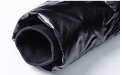
Knitted cuffs Knitted cuffs protect arm from cold windproof and