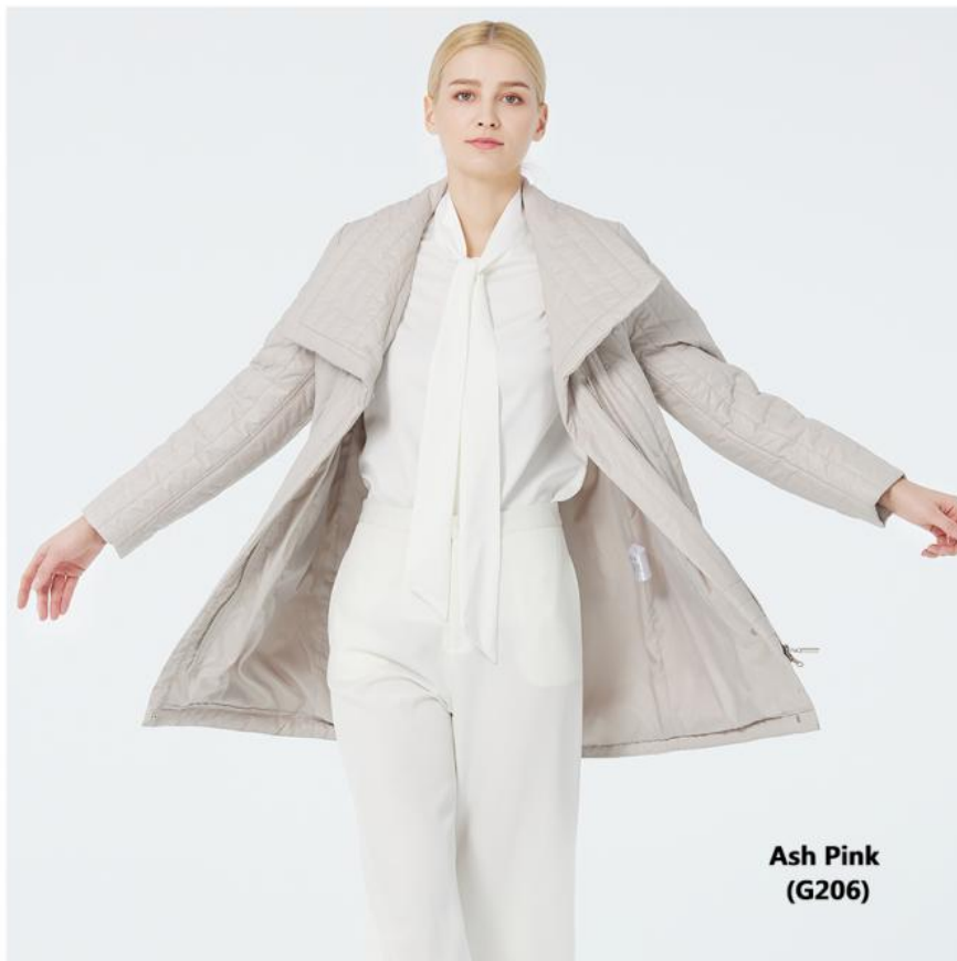
Ash Pink (G206)

In the sizing table all the parameters have been taken from the outer side of item. To determine the best size, please consult the seller. Our customer service will be glad to give a professional suggestion.