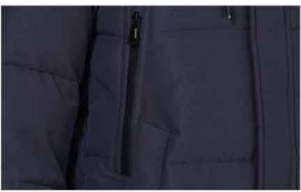
Mulit pockets design

Ribbed cuffs for comfort and dirt resistance, windproof and warm.