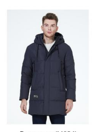
Deep gray (M604)