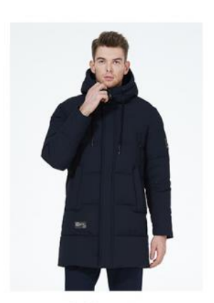
Dark blue (M460)