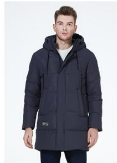
Deep gray (M604)