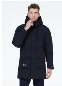
Dark blue (M460)