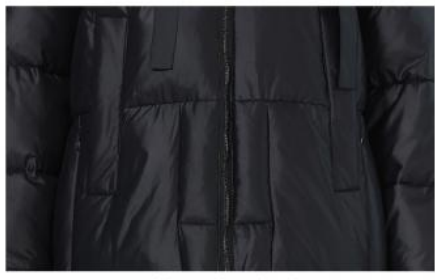
Multi pocket design Winter outerwear usually adopts zipper and button design, which can be easily put on and off, while also increasing the fashion and stability of items warm, especially for users in cold weather. the outerwear.