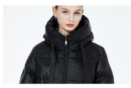
Hood and stand collar Double layer protection protects your neck, head, and face from the cold wind.