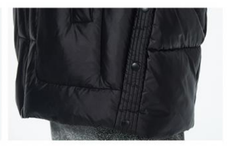
Unique side hem Sleeve for good wind-proofing and warm-keeping in cold days.