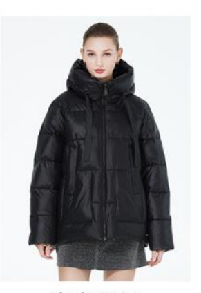
Light coffee (G170)