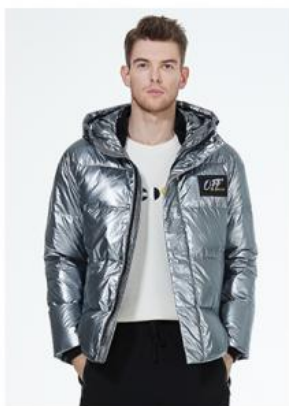
Silver gray (M652)