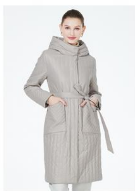
Light coffee (G206)