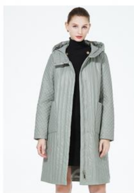
Grey green (G831)