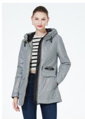
Deep gray (G681)