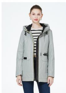
Green Crystal (G857)