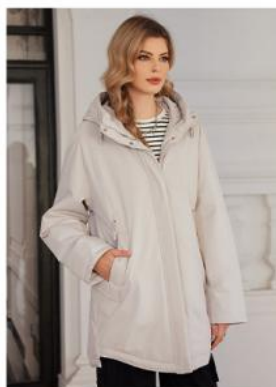
Color Beige Pink